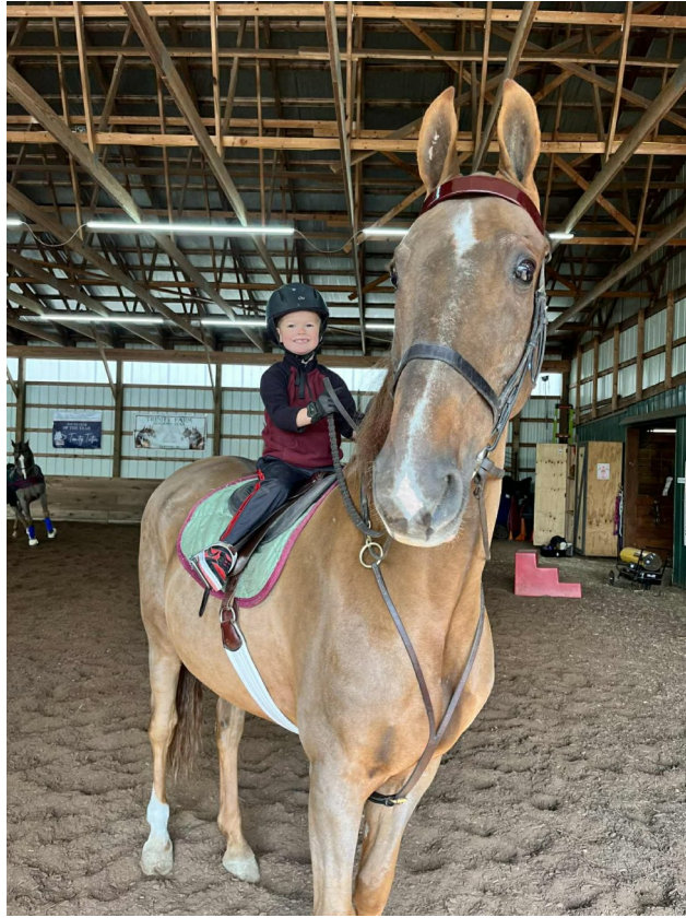
2025 Horse of the Show Winner "Rudy"